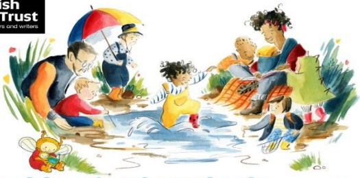
Illustration © Helen Meehan, Bookbug illustration by Orla Ginn

Scottish Book Trust inspiring readers and writers